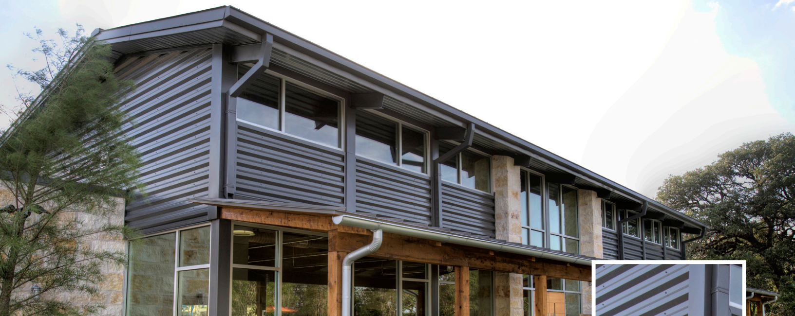
4.0 Wine Cellar, Fredericksburg, TX, USA

"For this winery concept, we selected the Hefti-Rib panel. It created bold shadows, installed quickly and was easy to acquire. We were so pleased with it that we used surplus material to build and skin an adjacent well house."